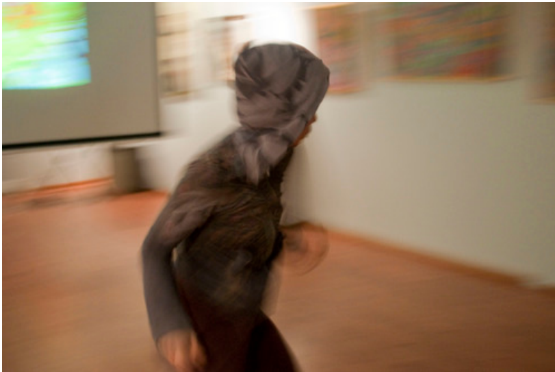
I like how this photo came out in a blur. :)